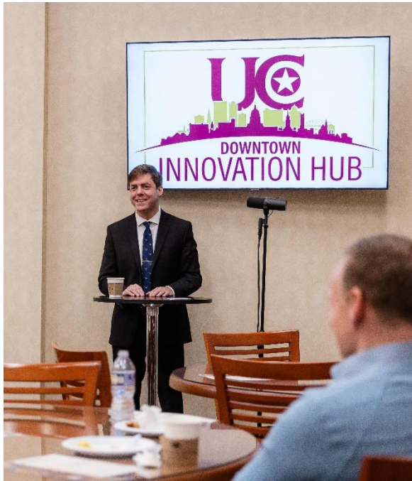
Innovation Hub in 2024!

There is an exciting new series that UC is bringing to the Downtown Innovation Hub for 2024. Inspiring Innovations will include six “Fresh Start Breakfasts” featuring area leaders sharing their innovative business, management, and leadership models, and four “Two Views Tuesdays” in which subject matter experts share different viewpoints on a contemporary topic that affects business success and quality of life in the Valley, followed by a networking happy hour.