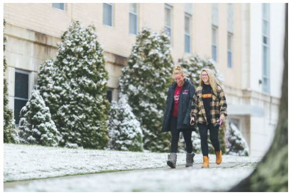
immediate impact on today's Golden Eagles.