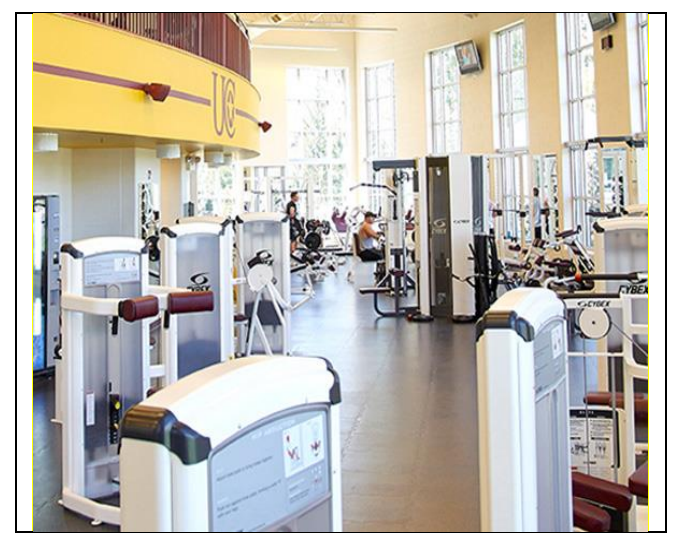
Morrison Fitness Center

The Morrison Fitness Center has state of the art cardio machines, along with workout rooms, free weights and a large variety of Cybex strength equipment which includes selectorized and plate loaded pieces. Special classes such as: Zumba, Yoga and other fitness opportunities are scheduled on a regular basis by the Fitness Center Director. Additional recreation facilities include two gymnasiums, an indoor swimming pool, and two handball/racquetball courts. Facilities are open for the use of students, faculty, and staff with a validated University I.D. card.